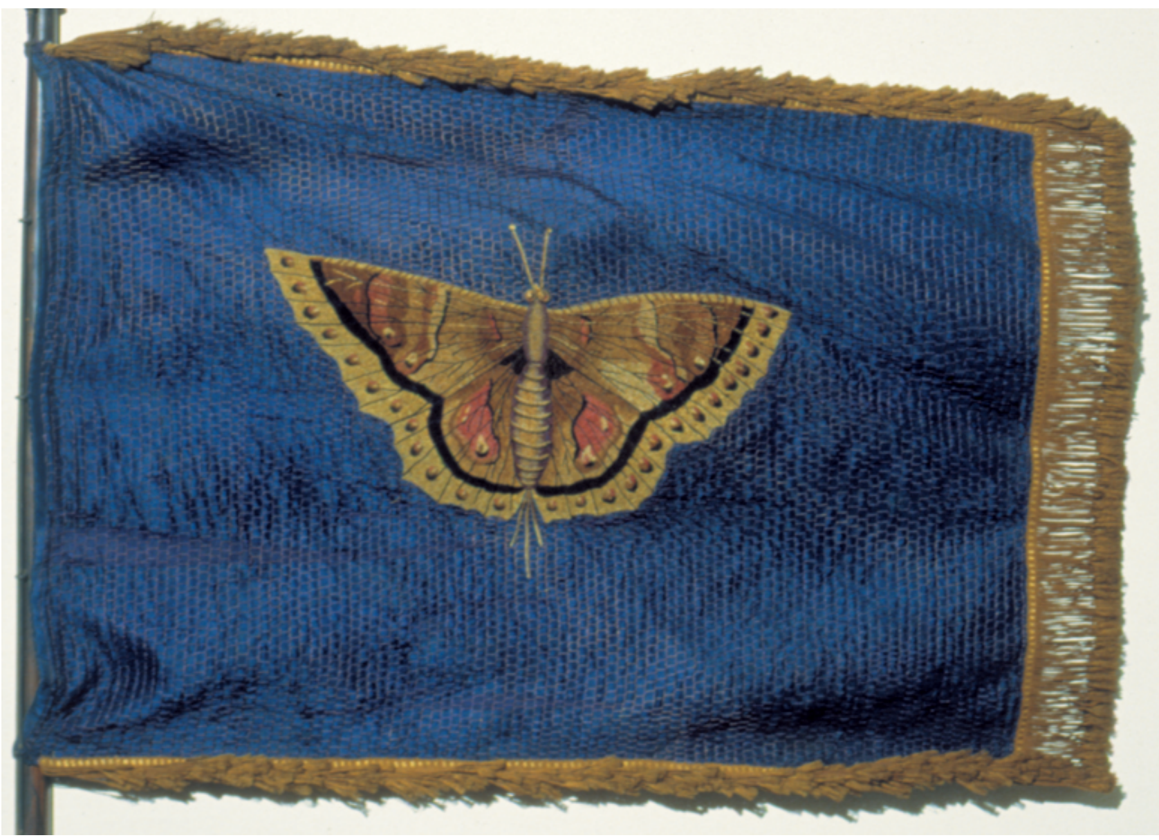
No. 8 Guidon, 3rd Cavalry, with distinctive butterfly design.

No less than six flags belonged to the Second New Jersey Brigade (originally the 5th-8th Infantry regiments). One is a rare, McClellan-style, designating flag from 1862 (No. 16). Four bear the badge of III Corps, to which the brigade belonged from 1862-64 (Nos. 7, 123, 126, 127), and another is a late war flag after the brigade was transferred to II Corps in 1864-65 (No. 124).