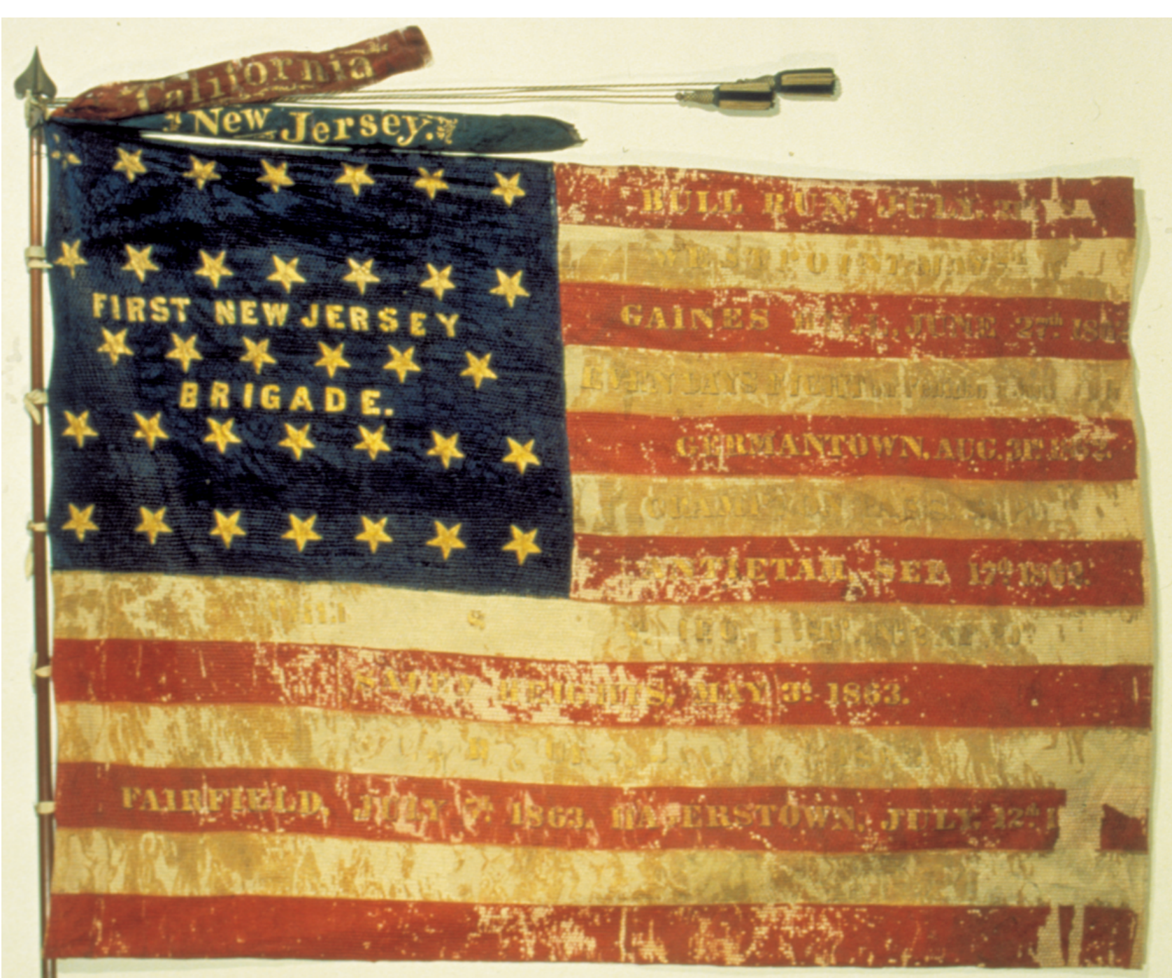
No. 125 National Color, 1st New Jersey Brigade, presented by New Jerseyans living in California on November 21, 1862.