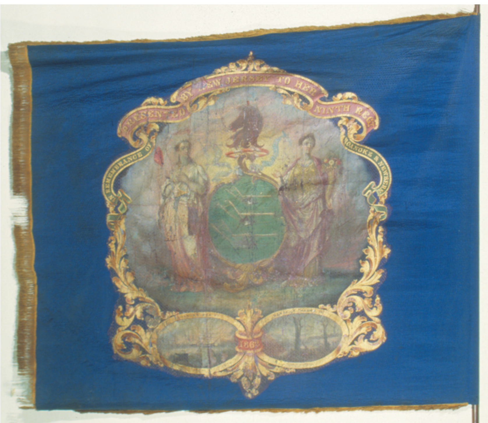
No. 52 Regimental Color, 9th Infantry. Distinctive presentation flag.