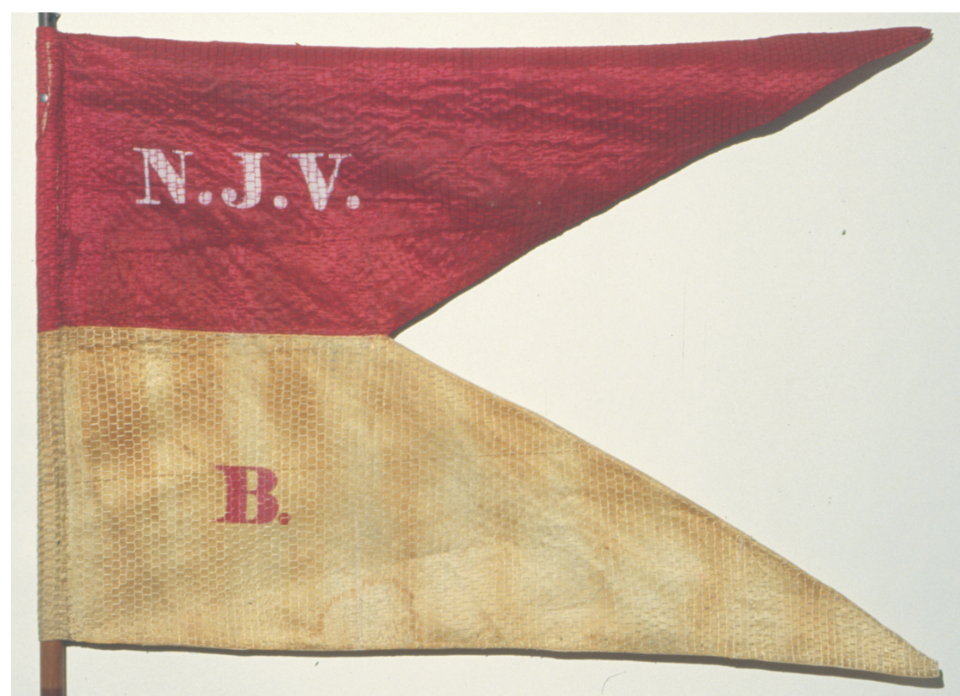
No. 133 Swallow-tailed guidon, Company B, 1st Cavalry, 1861 issue.